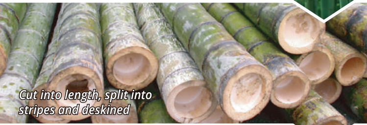
Cut into length, split into stripes and deskin