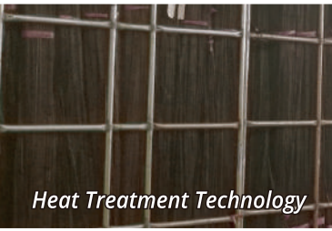
Heat Treatment Technology