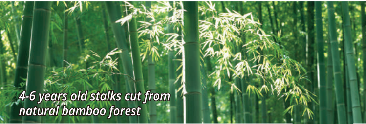
4-6 years old stalks cut from natural bamboo forest