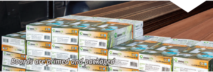
Boards are primed and packaged