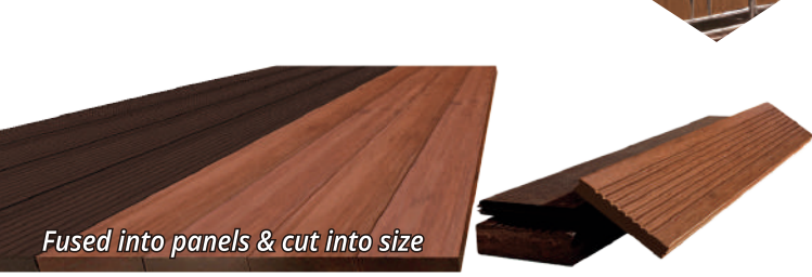
Fused into panels & cut into size